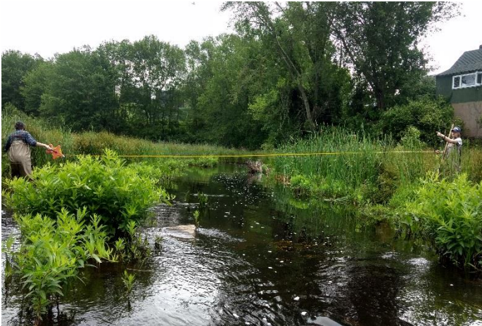
STS seasonal employees Greg Ostrinski (l) and Hillary Ballek (r) measuring the width of Whitford Brook at the former location of Hyde Pond. The downstream dam was removed in 2015.

My weekly Diadromous Fish Radio show is live on iCRV ( www.iCRVradio.com ) at 8:00 am on Wednesday and re-played at 3:00 and 7:00 pm that day 8 am on Saturday. I will be on the air tomorrow Wednesday June 28, perhaps talking about NASCO and international salmon management.