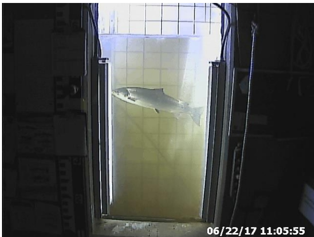
R-003-17. The third salmon to pass Rainbow Fishway this year. Nice bright fish, especially considering it's June 22!

Two more Shortnose Sturgeon were lifted this past week at Holyoke. Other than that, every number seems to have been bumped up a bit but not a lot—a handful more lampreys, one or two more Blueback Herring, etc. Probably the biggest jump was Striped Bass at Holyoke. Note that more Sea Lampreys were counted at Bellows Falls than at the downstream Vernon Fishway. We'll check next week to confirm these numbers. But Sea Lamprey are notoriously hard to count off video. The windows are illuminated all night to provide good images and the lampreys are drawn to the light and attach to the window and go back and forth. It is very difficult for a video reviewer to keep track of individual fish. Although all lamprey that ascend the Bellows Falls Fishway must first come up the Vernon Fishway, some might have slipped past Vernon uncounted. With all the things we had to do in the last two weeks, we were unable to get back to Holyoke and truck more shad down to Connecticut. The days Dave was available, there were no shad. When the shad showed up, he was committed elsewhere. But the U.S. Fish & Wildlife hauled several loads down to the Rainbow Reservoir in Windsor, CT. Over 300 fish were released. We expect to get final numbers soon. But we may have transplanted about as many as what passed up the fishway. Thanks to Ken and his colleagues! We did capture a few Sea Lampreys for transplantation to be used to establish runs in other streams (see below, right).