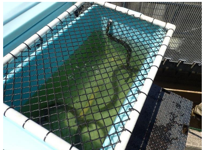
Adult Sea Lampreys captured at Rainbow. Preparing to be transplanted in other streams.